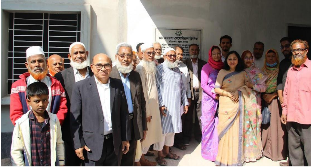
Installation Program of Dr. Ayesha Clinic (DAMC), Rahimanagar, Chandpur: 05.12.2026

Rahimanagar, Kachua, Chandpur, Bangladesh